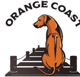
RHODESIAN RIDGEBACK CLUB

Incomplete, unsigned, conditional or unpaid entries will not be accepted.